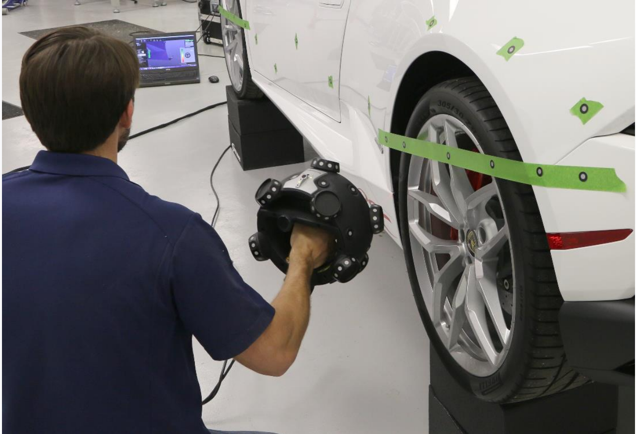
Getting into some other tight areas with the MetraSCAN.