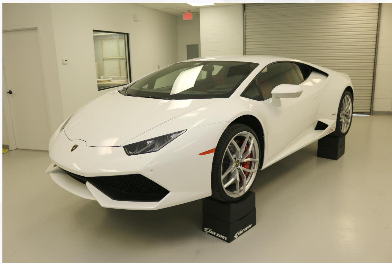
The Lamborghini Huracán ready for 3D Scanning in EMS's 3D Scanning Lab.

One of EMS's long time customers recently contacted us to 3D scan a 2015 Lamborghini Huracán. The reason for the 3D scanning is to develop new products for the car including a front and rear spoiler, side skirts and other ground effects.