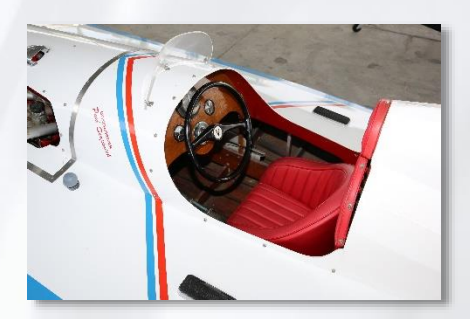
EMS used a Surphaser to capture the exterior & interior 3D scan data.