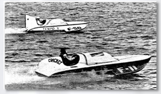
The Tempo V at the 1946 Biscayne Bay Regatta.