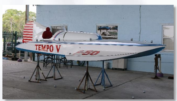
The restored Tempo V at Florida's Four Fish Marina.