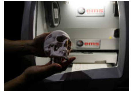
A skull 3D printed in a Z Corp 3D Printer

In addition, EMS demonstrated some of their medical model 3D printing and 3D scanning capabilities. This includes 3D scanning of custom cranial implants and creating rapid prototypes used in trauma and neuro-surgery procedures. This allows a surgeon to perform these operations faster with less “open time” for the patient because the custom implant is a perfect match.