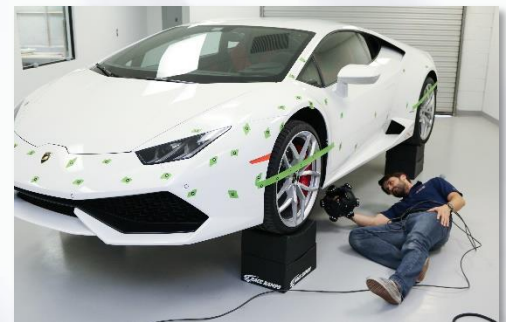
The Creaform MetraSCAN captures the underside and darker surfaces in detail.

3D SCANNING — 3D PRINTING — PRODUCT DESIGN