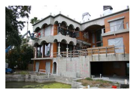
Bay Side of the Mansion

Visit www.ems-usa.com for more information.