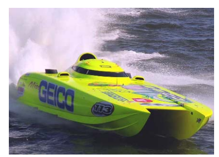
Geico Turbine Extreme Class Race Boat