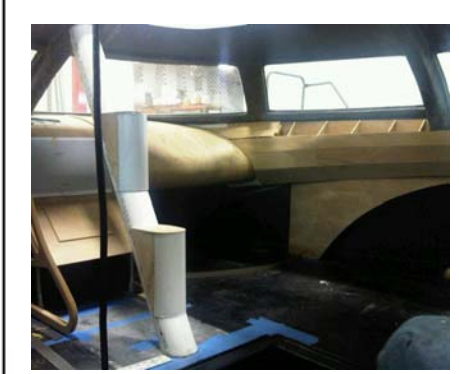
Interior of cockpit