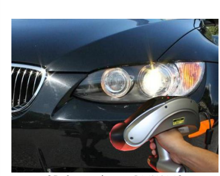
3D Scanning a BMW M3

Visit <u>www.ems-usa.com</u> to learn more.