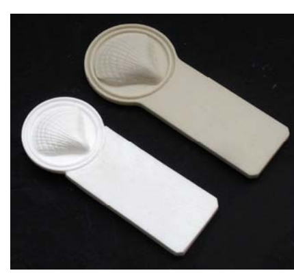
Original prototype and final 3D Printed rapid prototype

Visit <u>www.ems-usa.com</u> for more details.