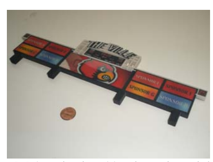
3D Printed advertising board model