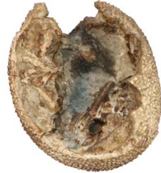
63 Million year old Dinosaur egg.

Visit www.ems-usa.com for more information.