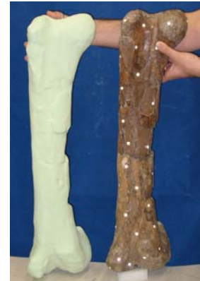
Original bone and finished 3D printed model from scan data