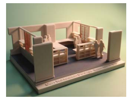
3D Office Layout