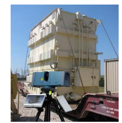
3D Scanning of transformer with a Surphaser 25HSX 3D Scanner

To learn more visit <u>www.ems-usa.com</u>