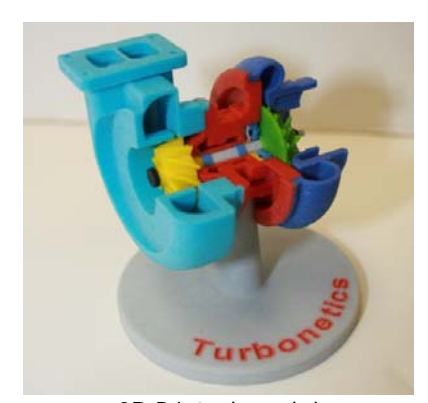
3D Printed model