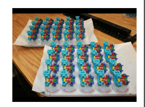
3D Printed models ready for shipping