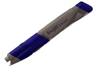
Initial Sketch & Finished 3D CAD Model